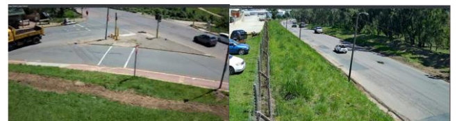
Two of the camera views

Keystone Park Estate Management Association has installed five CCTV cameras on the MR385, monitored 24/7 by Watchtech. This enhances the safety of Keystone Park and all employees in the area. Firms (or your security companies) seeking access to footage can contact us.