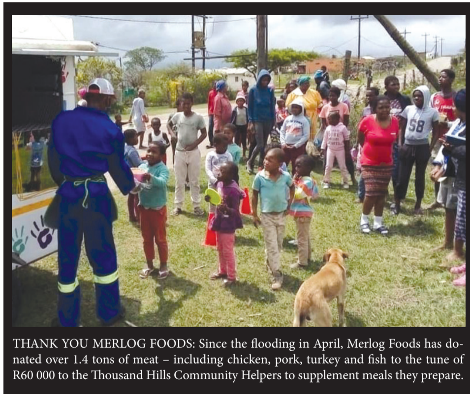
THANK YOU MERLOG FOODS: Since the flooding in April, Merlog Foods has donated over 1.4 tons of meat – including chicken, pork, turkey and fish to the tune of R60 000 to the Thousand Hills Community Helpers to supplement meals they prepare.

To demonstrate Kerry's commitment to the community they recently gave R150 000 to two charities operating in the Outer West. The positives from Kerry Ingredients investment into Hammarsdale have only just begun.