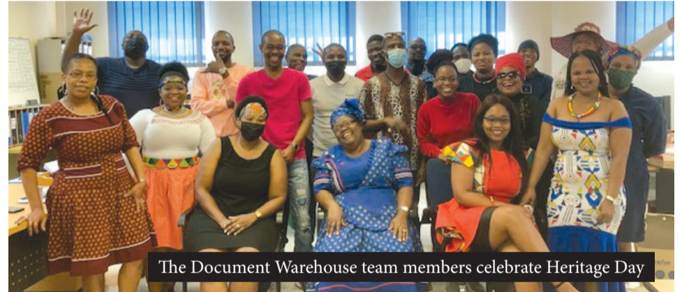
The Document Warehouse team members celebrate Heritage Day