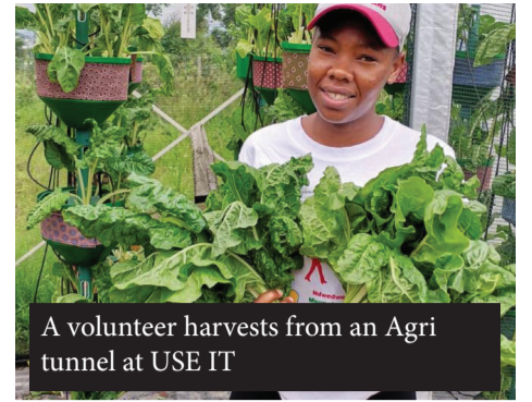
A volunteer harvests from an Agri tunnel at USE IT

DO MORE are also running an enterprise development project with the goal of creating young entrepreneurs alleviate hunger and restore hope.