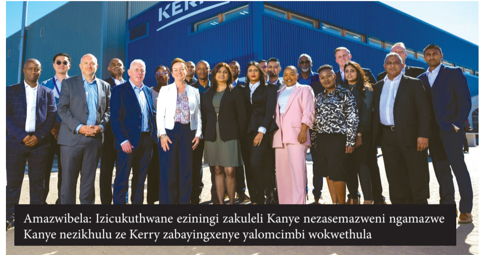
Amazwibela: Izicukuthwane eziningi zakuleli Kanye nezasemazweni ngamazwe Kanye nezikhulu ze Kerry zabayingxenywe yalomcimbi wokwethula

I RZ KWETHU iphinde ihlinzeke ngokuwasha izimoto, ukufaka amaloli imininingwane, ukuwasha ngaphakathi, izinsiza ezincane zokomgwaqo, ukuqinisa amaphalethi axegayo enqoleni, Kanye nokubeka umaka. Kanti kungaxhunywana nabo kulenombolo 073 372 3549.