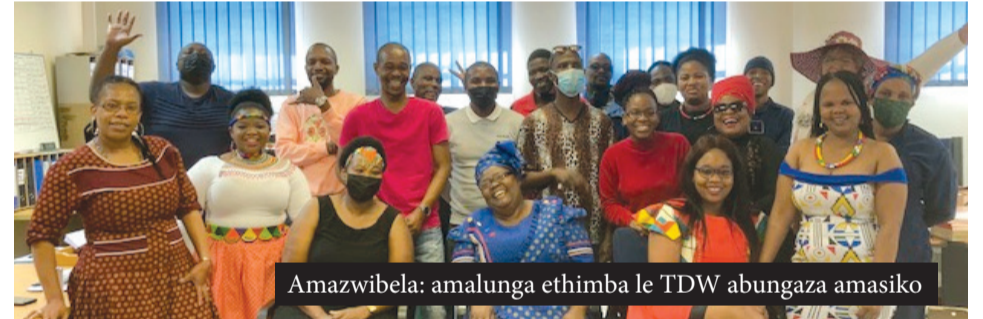
Amazwibela: amalunga ethimba le TDW abungaza amasiko