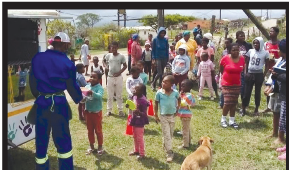
SIYABONGA MERLOG FOODS: emuva kwezikhukhula ngo April, Merlog Foods unikele ngaphezulu kuka 1.4 tons zenyama - okubalwa inyama yenkukhu, neyengulube, turkey kunye nezinhlanzi okubalelwa kuR60 000 kubasizi bomphakathi beThousand Hills Community Helpers.

Ukukhombisa imisebenzi yeKerry basanda kunikela nge R150 000 kwindawo ezimbini ezahlukene ezisebenza kwi Outer West. Imiphumela ye Kerry Ingredients eHammarsdale isiyabonakala.