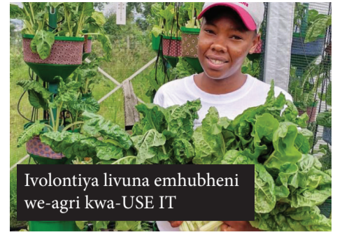
Ivolontiya livuna emhubheni we-agri kwa-USE IT

kungasikudala amisiwe ekutheni ASEBENZISE eHammarsdale. Izitshalo eziningi zingakhuliswa isikhathi esinguhhafu bese kusebenziswa ingxenye yamanzi uma kuqhathaniswa nezindlela zendabuko. Lesinyathelo besingeke siphumelele ngaphandle kokhaxo lwase PEP, nase Buckman Laboratories, ne CHEP Kanye ne USE IT.