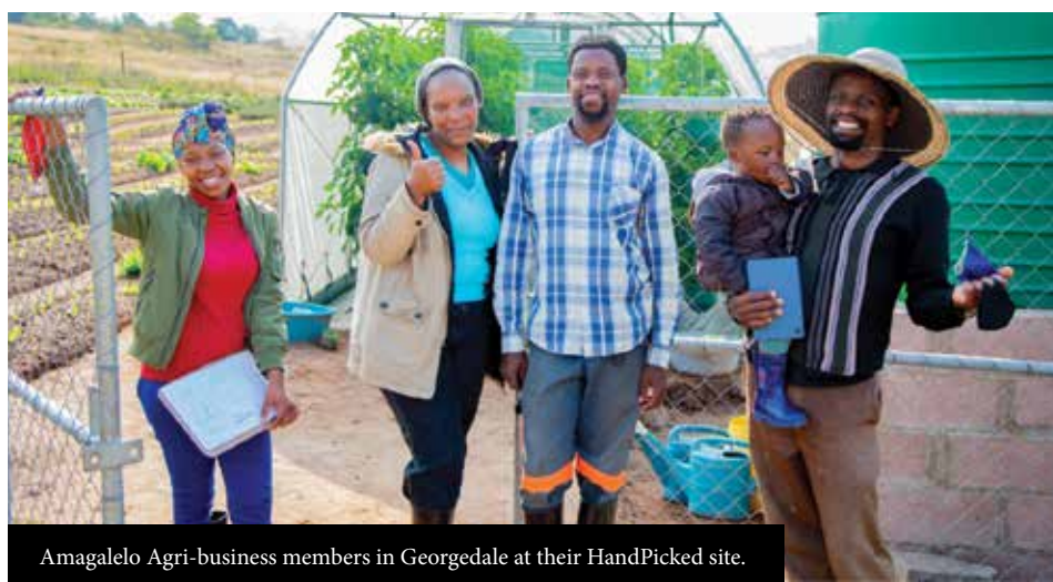
Amagalelo Agri-business members in Georgedale at their HandPicked site.

The Mr Price Foundation also provided food parcels to the staff of many smaller companies and informal traders who were affected by the looting. www.mrpfoundation.org