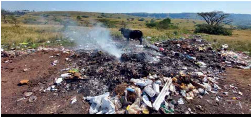
Illegal dumping on Harrison Flats was dangerous for both people walking through the area and grazing cattle.