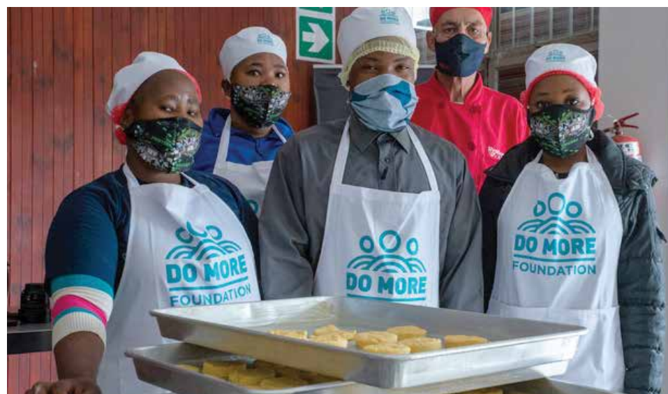
DO MORE FOUNDATION bakers supply fresh bread to 30 ECD centres in Hammarisdale daily.

082 911 can be used for free to reach any SAPS station in the country.