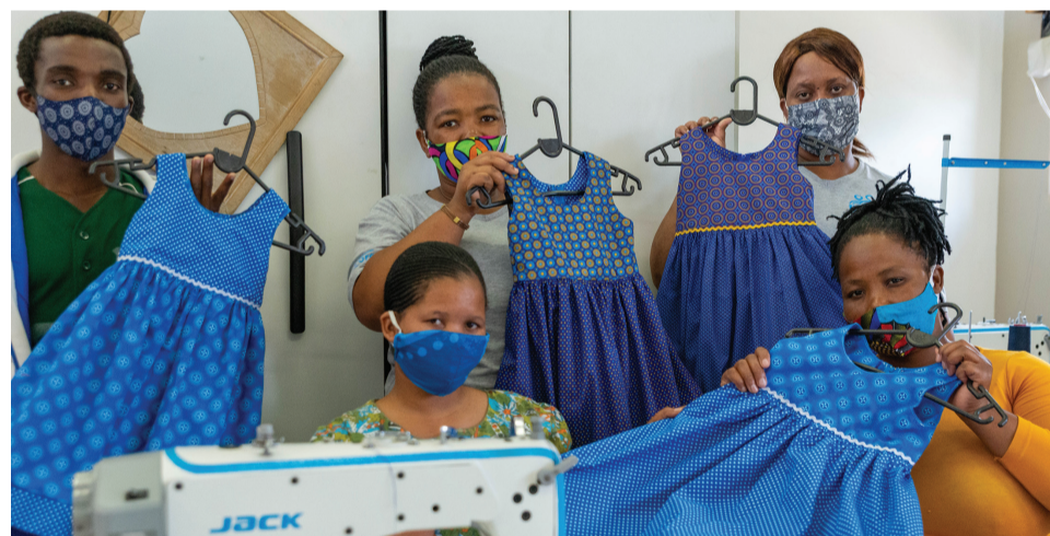
Okwethu Umqhele members in their new premises at USE-IT show off new products.

SMMEs will also be able to network and engage with the HCRDA and identify areas of collaboration. Interested SMMEs are encouraged to register their business at www.hcrda.org/smme-directory