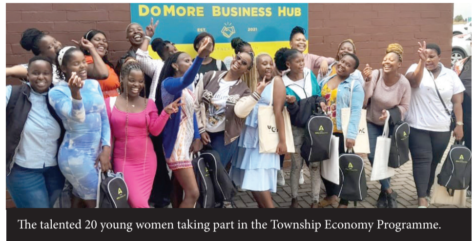
The talented 20 young women taking part in the Township Economy Programme.

ing is complete, they will be incubated for six months at the DO MORE Business Hub. Here they will be supported to translate the training into practical business operations. The programme will conclude in September 2023 when they will be given the opportunity to pitch to possible investors who could inject funds into their business to accelerate their growth. Thanks to Rainbow Chickens, USE IT, Pepkor Speciality, Buckman Laboratories and all supporters of the DO MORE FOUNDATION for delivering this impactful programme – and the women of Hammarsdale!