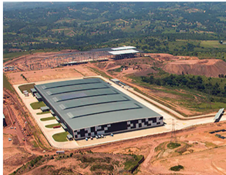
Development at Keystone Park has been rapid with nine firms now in full operation.

Thousands of construction jobs have been created and many more will be as the final sites are developed in the coming year. Thousands of permanent direct jobs with occupiers and their suppliers have been created on what was a sugar cane field just a few years ago. Firms in Keystone Park say they pride themselves on the many local jobs created. Currently over 90% of employees within the Park live in the Outer West.