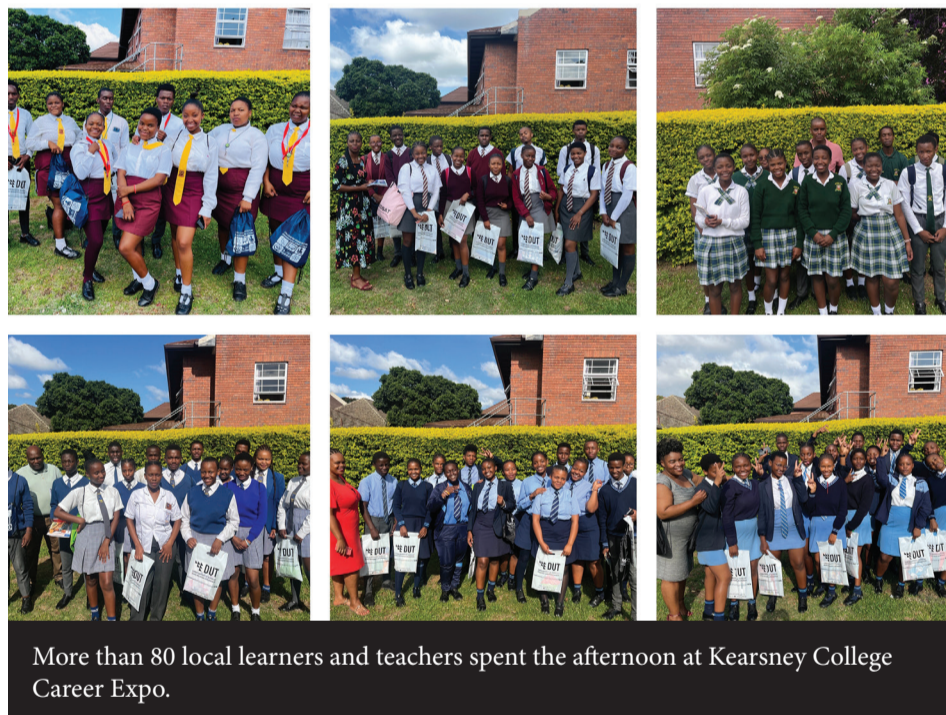
More than 80 local learners and teachers spent the afternoon at Kearsney College Career Expo.

Eight schools managed to send a group of pupils and teachers who were inspired by the 60-plus exhibitors who opened their eyes to many future study and career options.