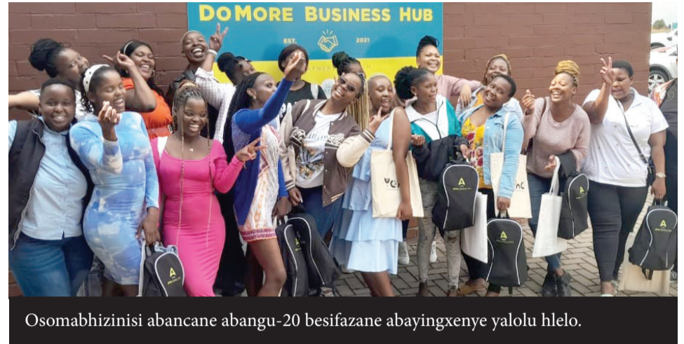
Osomabhizinisi abancane abangu-20 besifazane abayingxenywe yalolu hlelo.

Siyabonga kakhulu kuRainbow Chickens, USE-IT, Pepkor Speciality, Buckman Laboratories kanye bonke abalandeli bayo iDo More Foundation ngohlelo olunohlonze kangaka- sibonge abesifazane baseHamarsdale ngokubamba iqhaza.